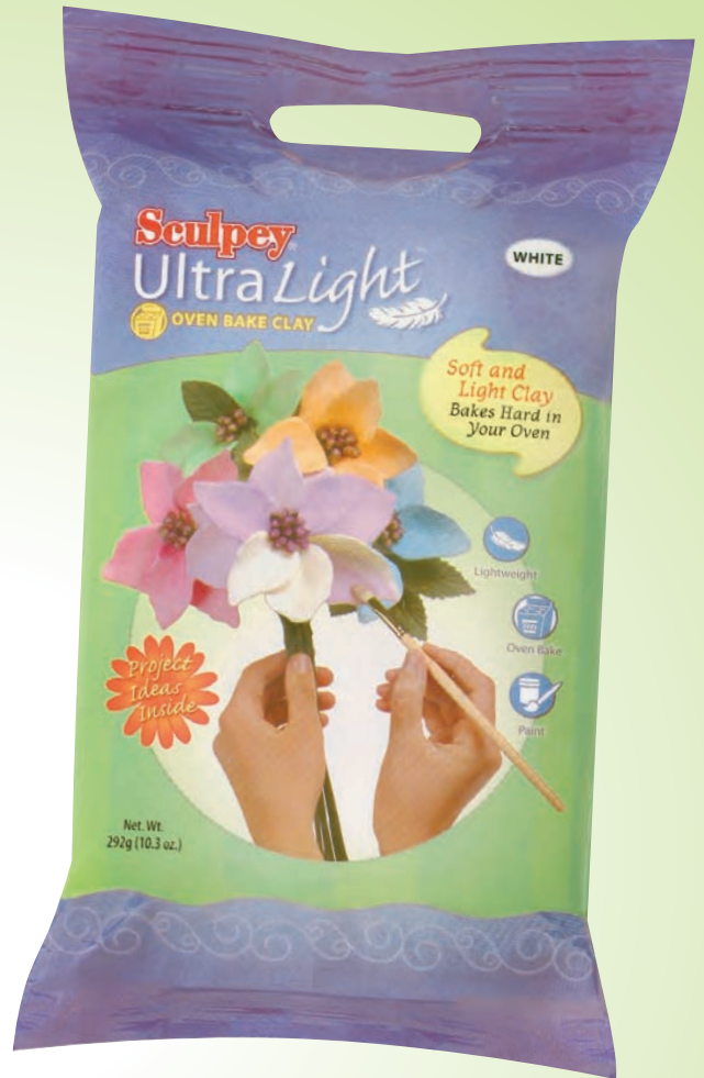
Sculpey UltraLight—White, 10.3 oz. pkg. Item No. LW2001

Just like Original Sculpey, cured Sculpey UltraLight can be sanded, drilled, buffed and painted with 100% acrylic paints. This remarkable new clay brings a world of new opportunities to artists, crafters and clay users alike. Sculpey UltraLight will surely become an instant favorite.